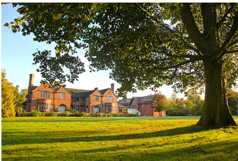
The Nazarene Theological College, Didsbury, Manchester

When feasible a hot desk will be made available at the college and local MJR Manchester meetings and events can be hosted there. The college will also co-promote MJR activities and, subject to availability, provide space for events.